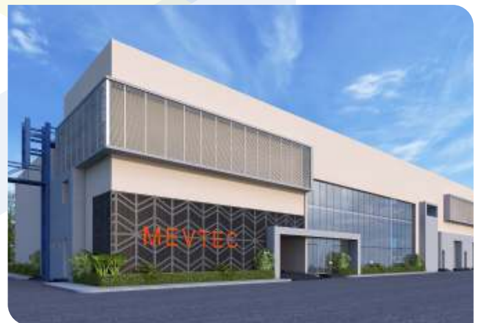
MRV - GEVTECH PROJECT