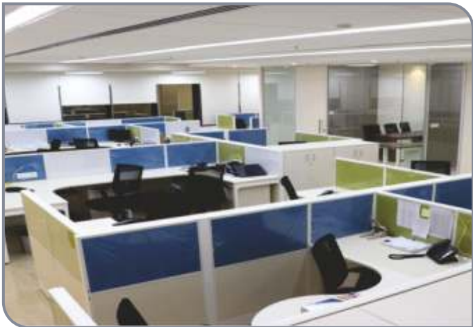
EYWA - PHARMA