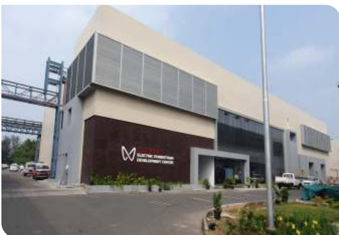
MRV - GEVTECH PROJECT