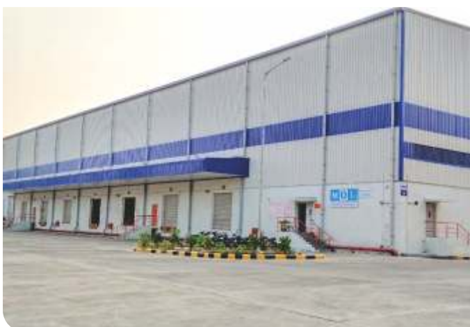
VALUE SPACE LOGISTICS - CHENNAI