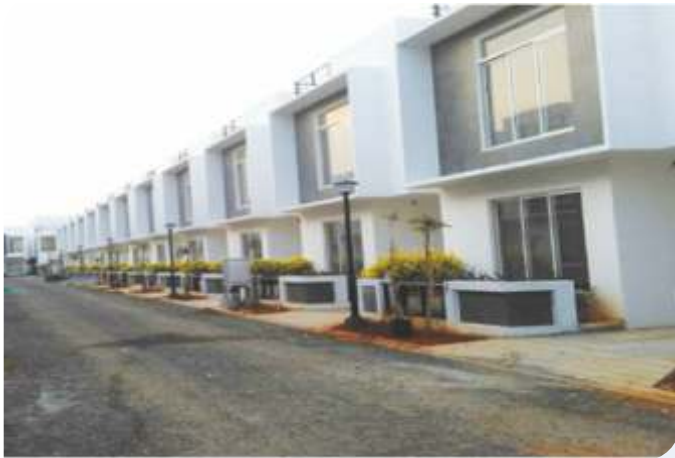
CASA GRANDE- VILLA CHENNAI