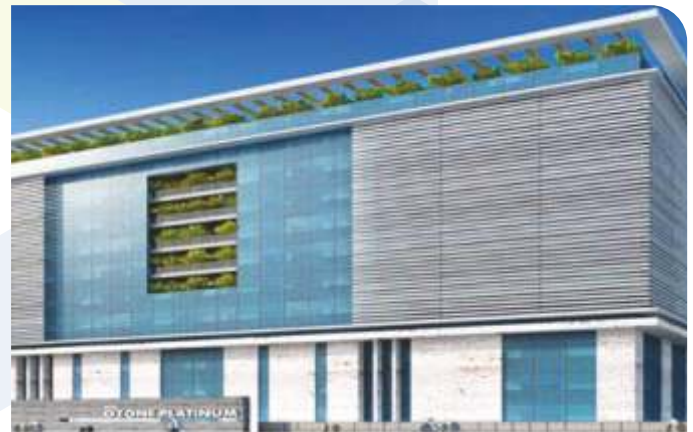
OZONE - NAVALUR CHENNAI