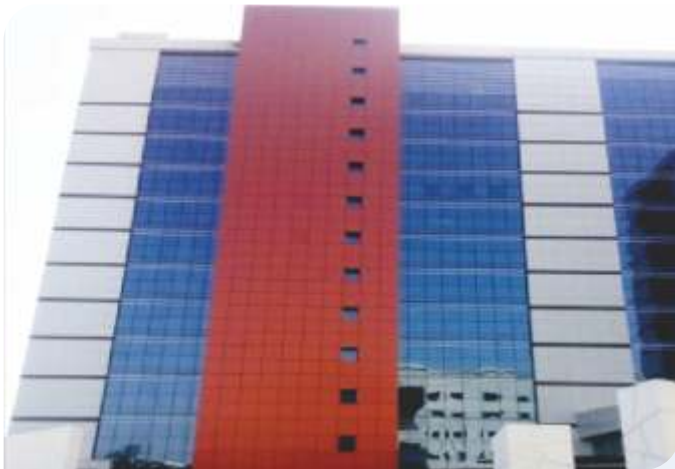
TICEL BIO PARK