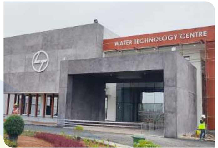
L&T Water Technology center