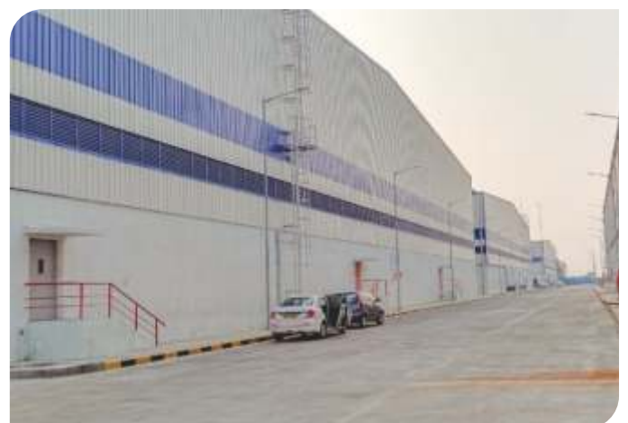
VALUE SPACE LOGISTICS - CHENNAI