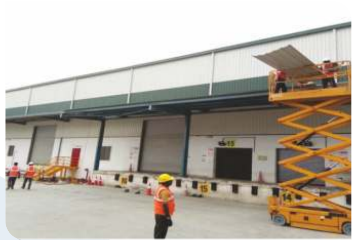
AMAZON - WARE CHENNAI