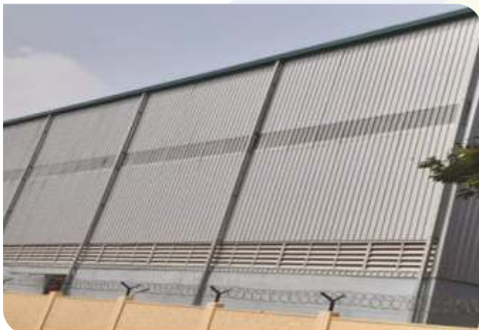
VINPLEX - W7 - CHENNAI