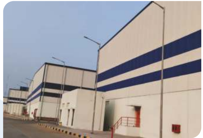
VALUE SPACE LOGISTICS LTD - WAREHOUSE CHENNAI