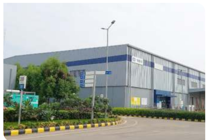
IDOSPACE B-300 AT COIMBATORE