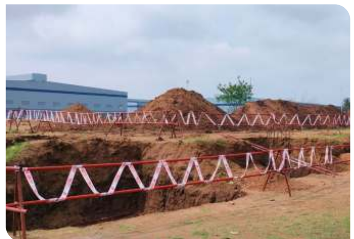
INDOSPACE B-300 EATH WORK PROGRESS