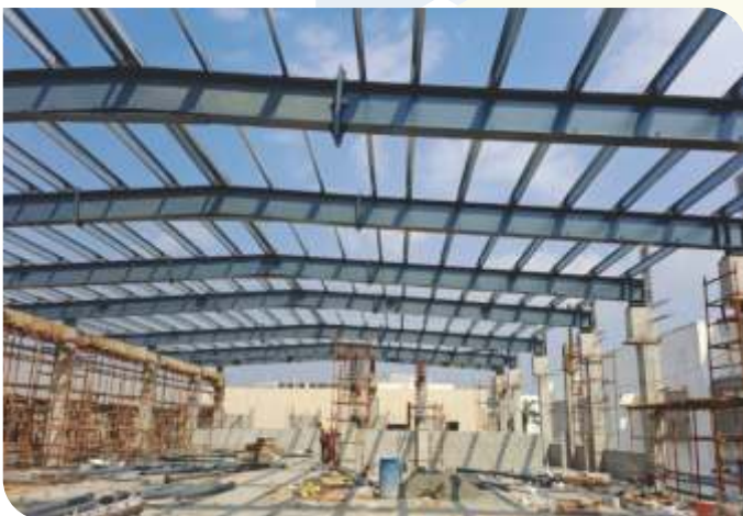
MRV - GEVTECH PROJECT