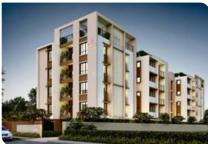
Krishna Construction- The meadows