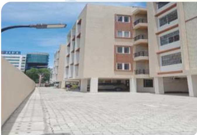
KRISHNA GROUPS - APPARTMENT CHENNAI